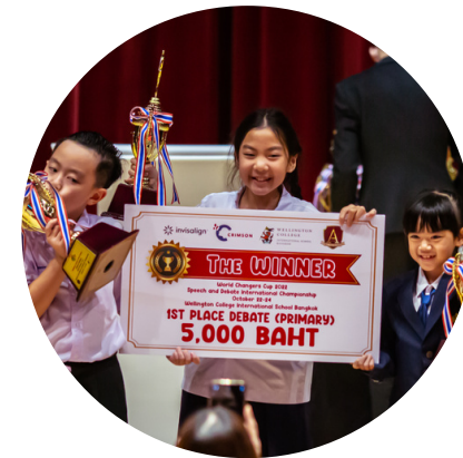
Preparation to excel at Competitions

Our program offers a wide range of classes to cater to students of all levels and interests. Whether you are just starting out and need to build your skills from scratch, or you are a seasoned debater looking to take your abilities to the next level, we have a class for you. Our courses cover a variety of topics, including persuasive speaking, impromptu speaking, World Schools Debate, World Scholar's Cup debate, and more.