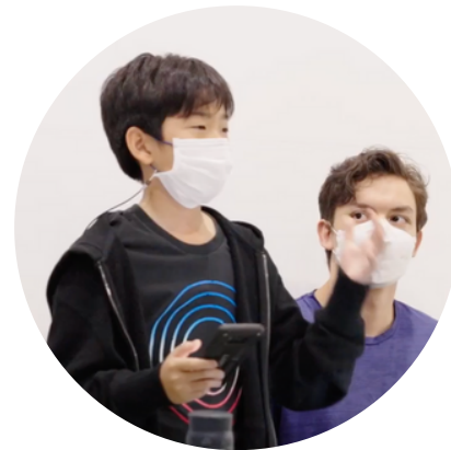
Demo Session at the end of 8 weeks