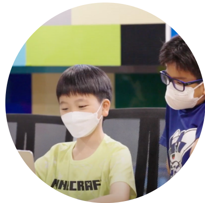
6 - 8 students Maximum per class

Our expert instructors are not only experienced in speech and debate, but they are also passionate about helping students succeed. They provide a fun and engaging learning environment, where students can feel comfortable exploring their creativity, challenging their assumptions, and collaborating with peers.