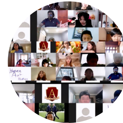
Online Classes available