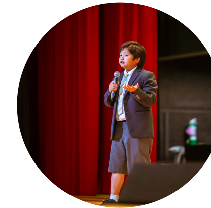
Applying what has been learnt in class in front of a real audience

We also offer a range of resources to help students excel, including access to our expert coaches, online learning modules, practice debates, and one-on-one tutoring sessions.