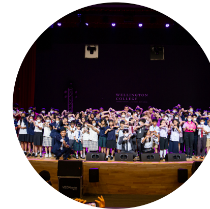
Joining several prominent Speech and Debate competitions